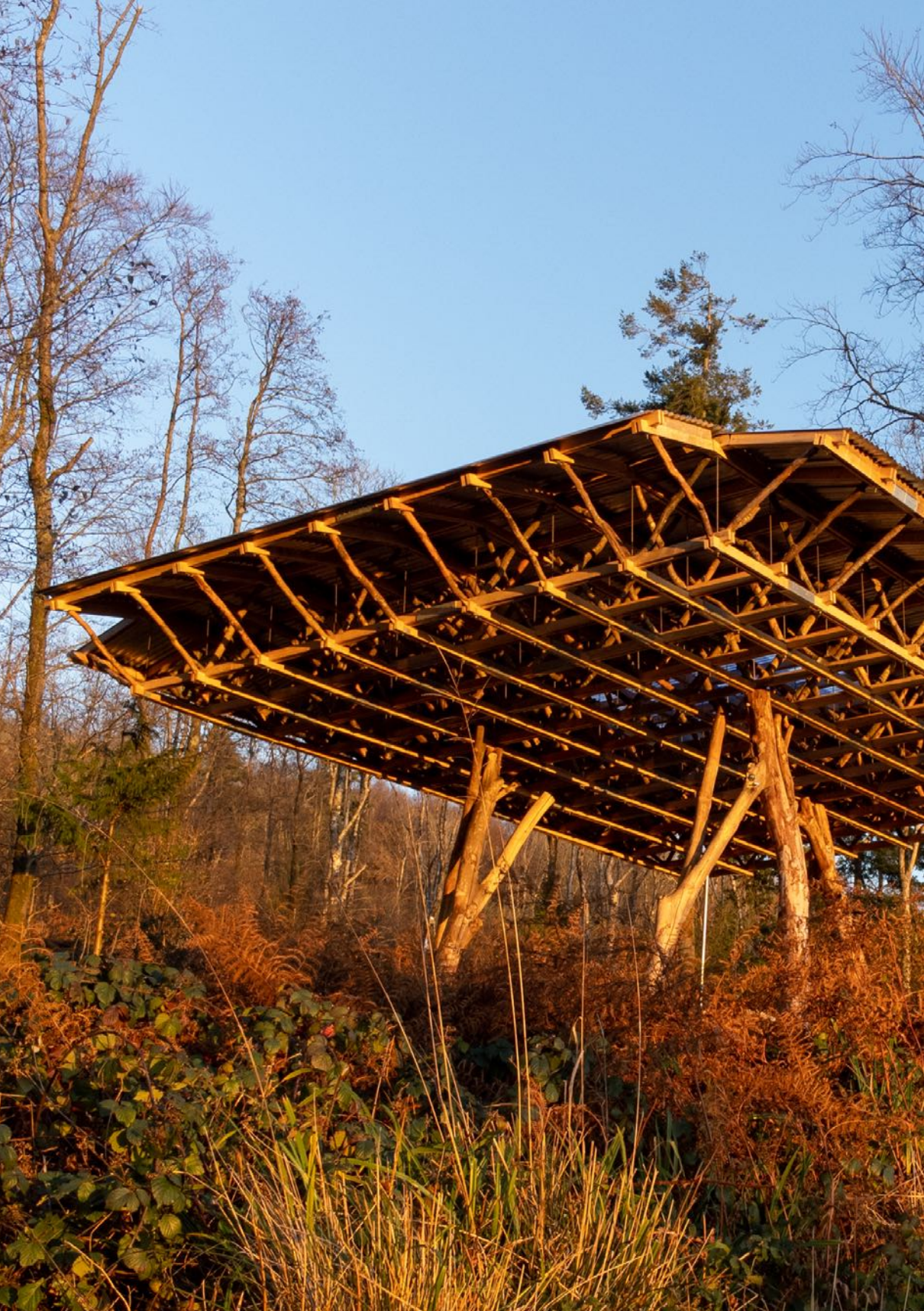
The Field Station, Hooke Park, Dorset, 2023.