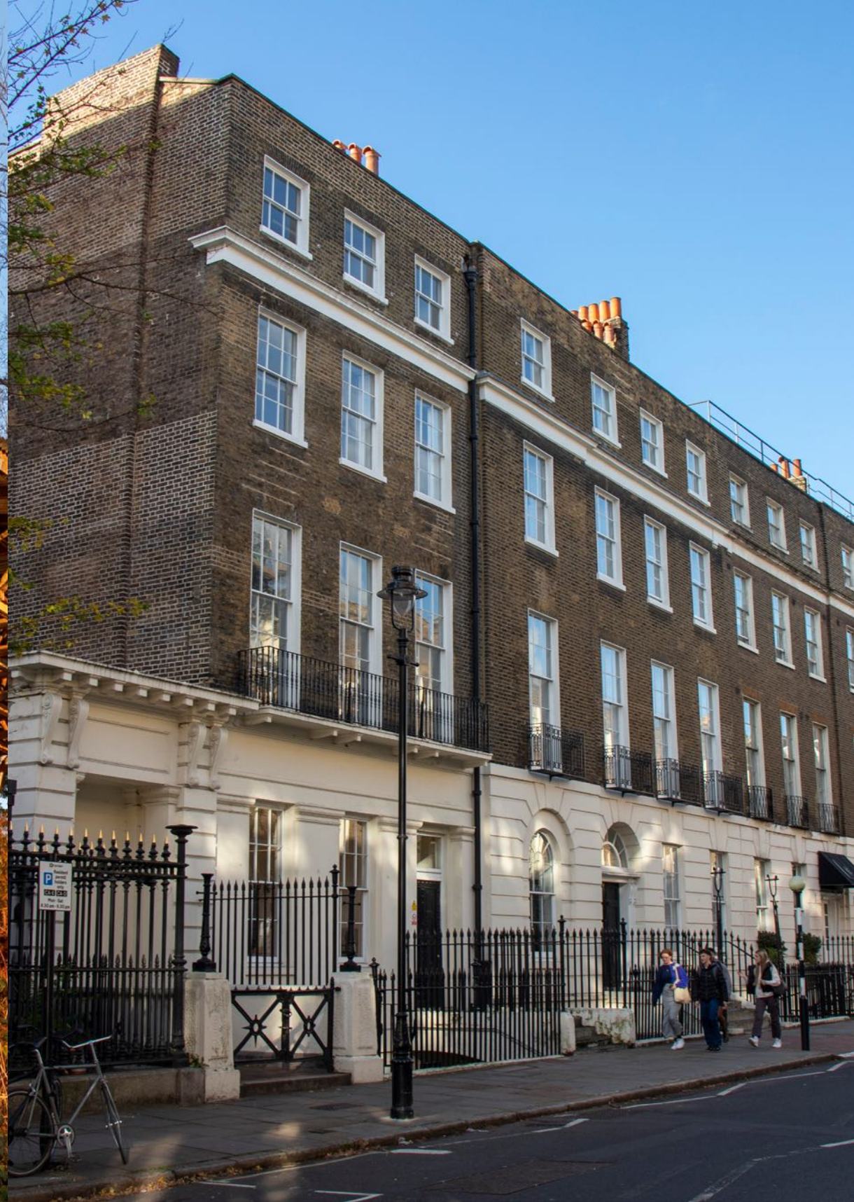
The AA buildings on Montague Street, London, 2023.